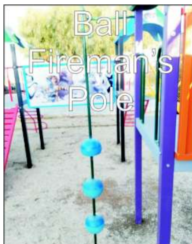
Ball Fireman's Pole