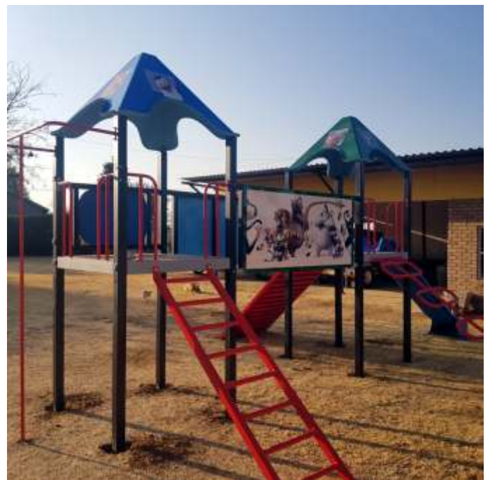
Jungle gym with two platforms and roofs

First and Second platform joining with a fixed bridge