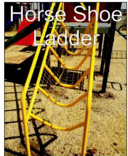
Horse Shoe Ladder