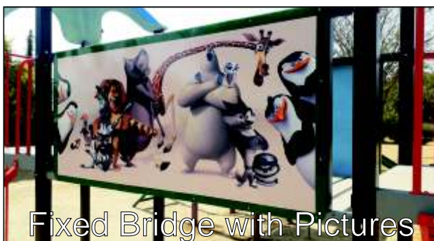
Fixed Bridge with Pictures