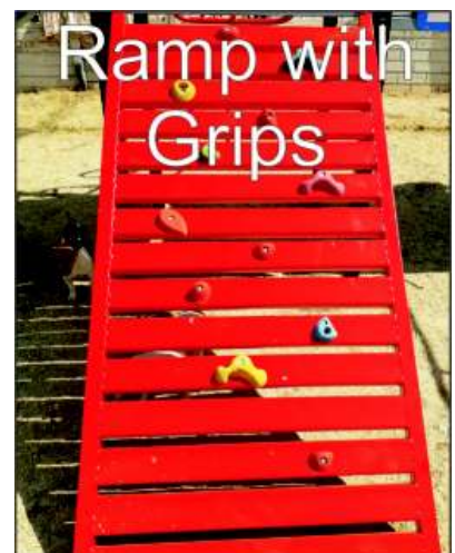
Ramp with Grips